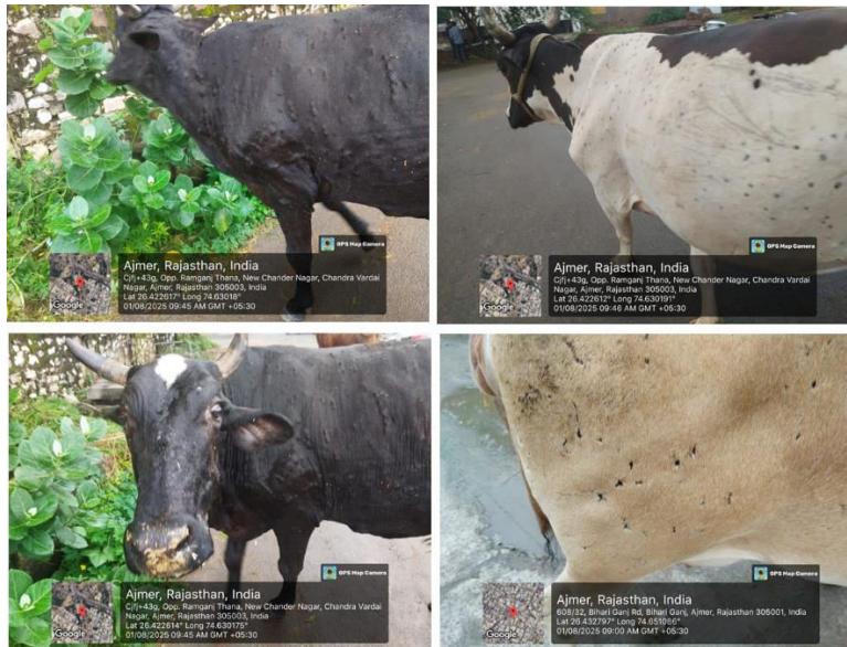
Fig 3: Lumpy Skin Disease Observed in Cattle at Ajmer, Rajasthan